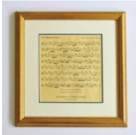
"The Maltmen March"

"I was commissioned to compose a tune to be played at the Annual Dinner of The Incorporation of Maltmen. I was delighted to do so and have been invited to play the tune at all subsequent dinners. The composition is a Hornpipe and within it I have tried to convey the bubbly effervescence of the brewing process."