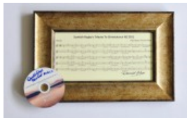
"Scottish Rugby's Tribute to Christchurch NZ 2011"

"Thank you for your letter, manuscript and CD of your composition "Scottish Rugby's Tribute to Christchurch New Zealand 2011".