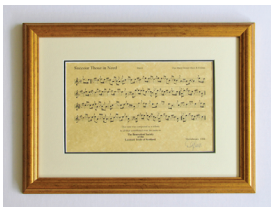
“Succour those in need”