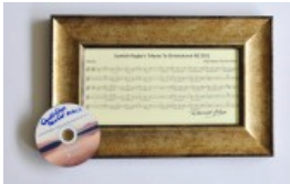
"Scottish Rugby's Tribute to Christchurch NZ"